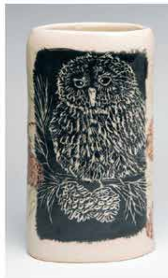
Honourable Mention Jane Whitaker Bird's Eye View From the Pines 8" x 5" x 3" Handbuilt stoneware, oxidation $150