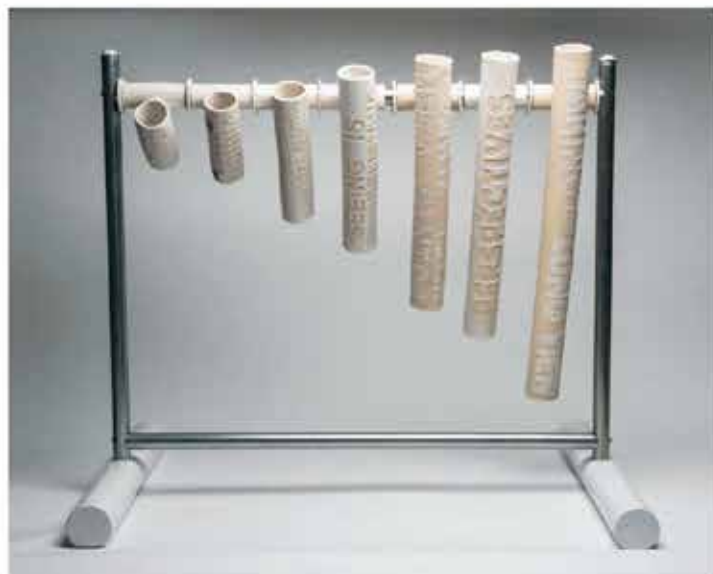
Deb Reilly Tunnel Vision 25" x 30" x 25" Handbuilt stoneware, oxidation & mixed media $725