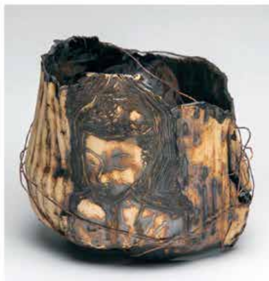
Most Imaginative Linda Szoldatits I'm NOT Broken 9" x 19" x 8.5" Handbuilt stoneware with copper wire $450