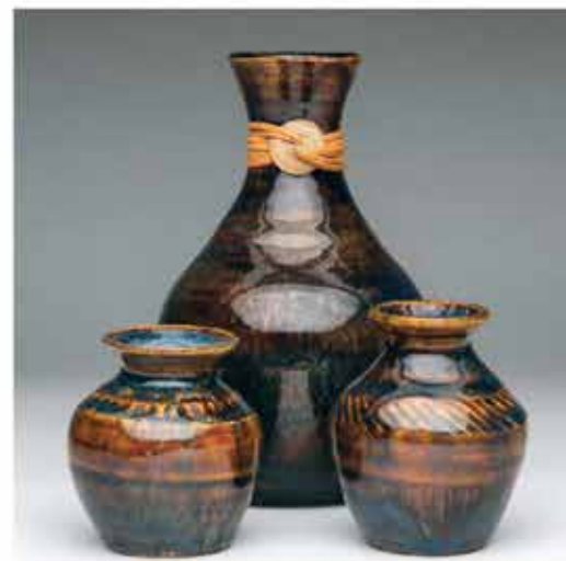
Marg Rice Sacred Vessels (set) 5" x 3" x 1.5" Wheel thrown stoneware with cane, oxidation $90