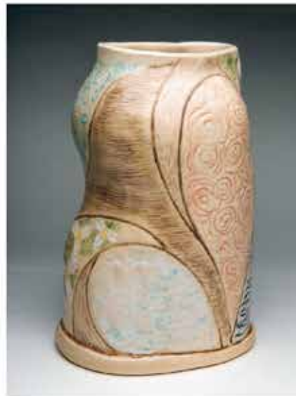
Diane Jupp A Walk through the Forest 10" x 5" x 6" Handbuilt stoneware, oxidation $125