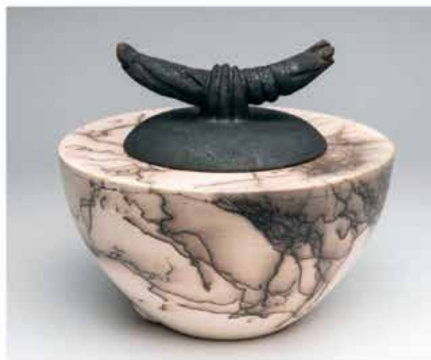
David Schembri Strands 2 6.5" x 7" Wheel thrown & assembled stoneware, raku fired, white terra sigillata & horse hair $210