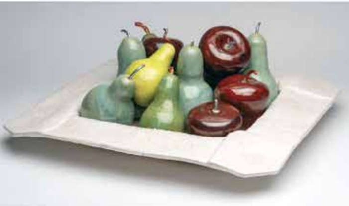
Jen Scherle Fruit Bowl 15"x15"x 6" Handbuilt, thrown and altered fruit & bowl, oxidation $800