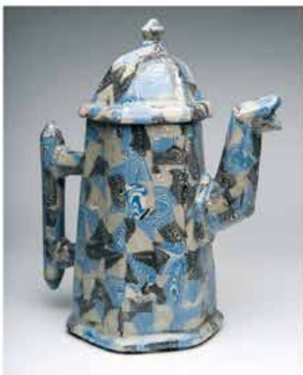
Angela Daust Coffee Pot of Broken Dreams 10"x9"x5" Handbuilt nerikomi, porcelain, oxidation $600