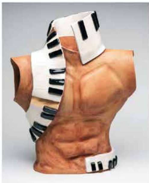
Lesley Pettigrew 9 O'Clock on a Saturday 17" x 12" x 6" Handbuilt stoneware, oxidation $625