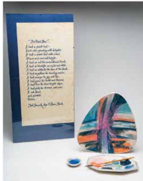
Della Cavanagh Choose your Colour (Set of 4 pieces) 24"x 12" Handbuilt porcelain, oxidation $200