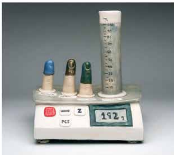
Paoletta DiFillippis Intuition and Science 10"x8"x7" Handbuilt stoneware & porcelain, oxidation $240