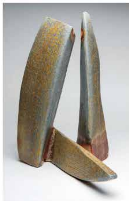
Teresa Dunlop Tectonic Shift 14"x14"x8" Handbuilt stoneware, wood fired to cone 11 $525