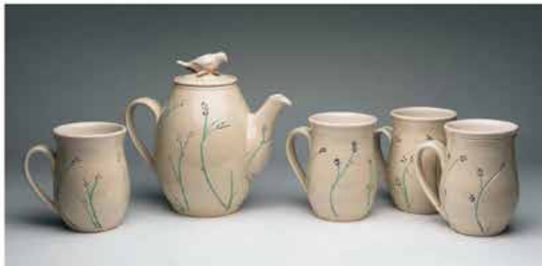
Kendra Honey Garden View (set) 8" x 5" teapot, 5" x 3.5" mugs Wheel thrown porcelain, oxidation $325