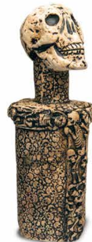
Aldo Ronis Pirate's Spirit 11.5" x 4" x 4" Handbuilt stoneware, oxidation $250