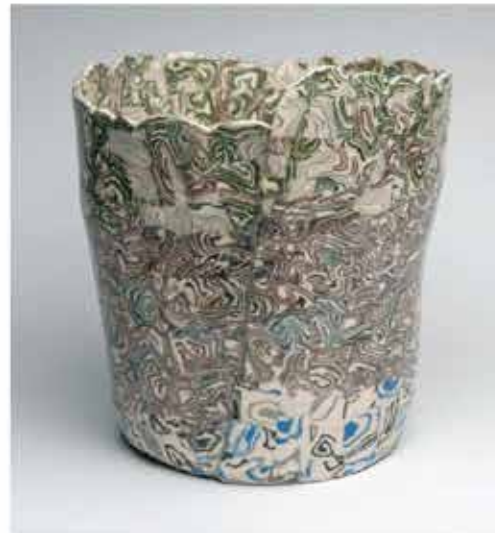
Angela Daust Black Trees on a Rocky Northern Shore 10"x 10" Handbuilt nerikomi, porcelain, oxidation $600