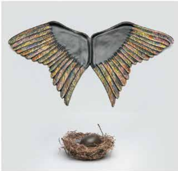
Donna Fegan Watching Over 10.5" x 19.5" x 2" Handbuilt stoneware, mixed media, oxidation $320