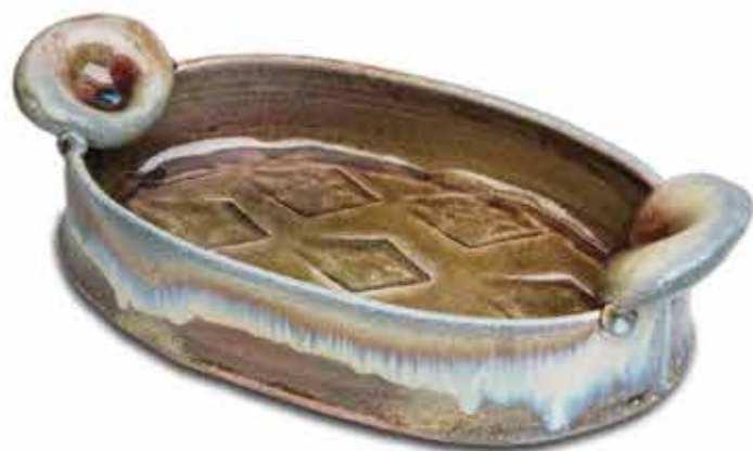
Teresa Dunlop Love Handles 4"x13.5"x6.5" Wheel thrown and altered stoneware, wood fired to cone 11 $240