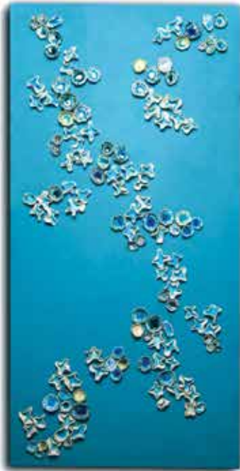
Jennie Creegan Evanescence 48"x 30"x 1.5" Pinched porcelain, glass, oxidation, wax resist & mixed media $1,200