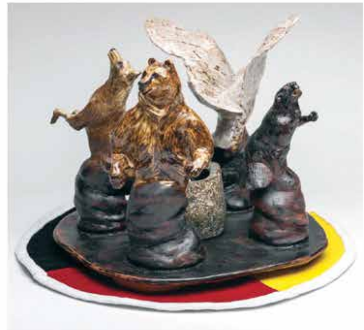
Best Sculptural Rebecca Lalumiere Moulded from Mother Earth - The Four Sacred Directions 12" x 12" x 12" Handbuilt stoneware & mixed media $600