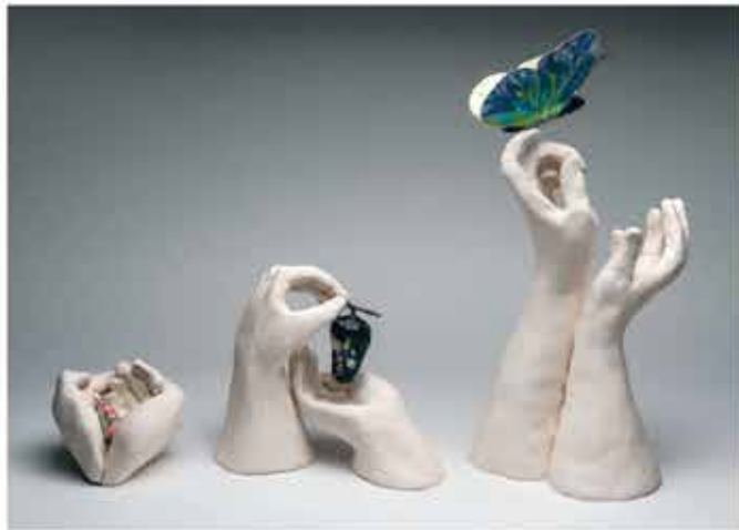
Sandy Bobrow TRANSformation/A Mother's Love 15"x 10"x 21" Handbuilt stoneware, oxidation & mixed media $2,800