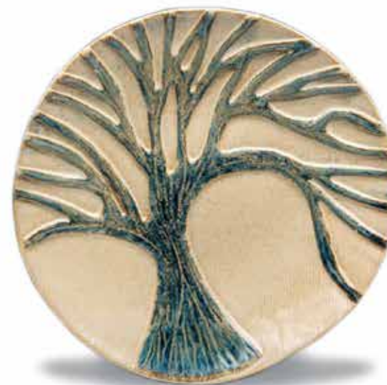
Cheryl Milne Tree of Life 15.5" x 14" x 6.5" Handbuilt stoneware, oxidation $250