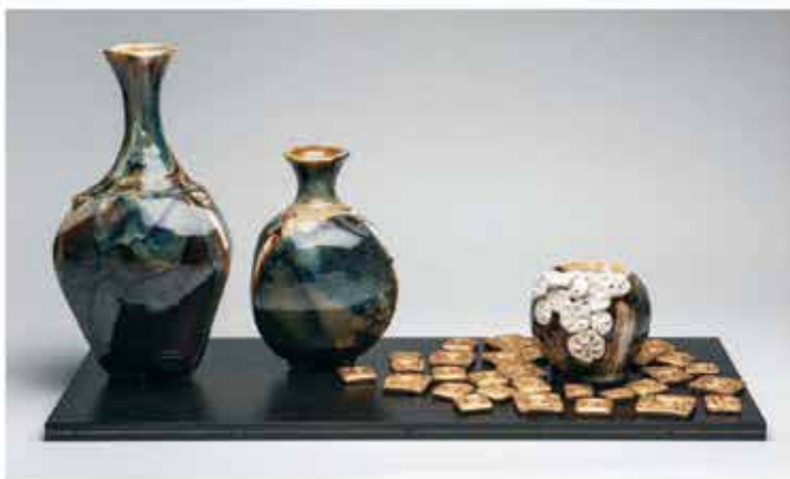
Robert Walter Artificial Intelligence - Evolution 11.4" x 6.1", 7.4" x 6.18", 4.1" x 4.25" Wheel thrown porcelain, oxidation $320