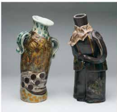
Margaret McIntosh Still Got It 10" x 4" x 4" (2 pieces) Handbuilt stoneware, oxidation $180