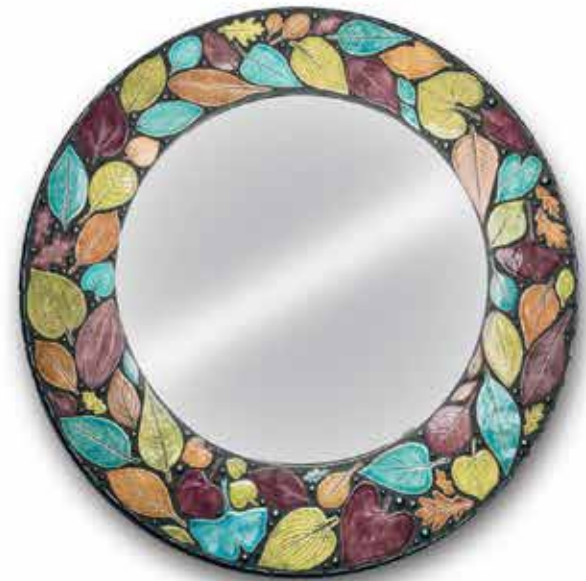
Rhonda Uppington Swirling Leaves (mirror) 24"x 1" Handbuilt earthenware, oxidation $650