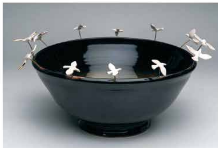
Honourable Mention Cathy Harris Snow Petrels 6" x 10" Wheel thrown porcelain, handbuilt birds, oxidation & 22kt gold $320