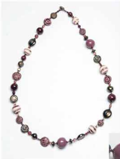
Untitled (Beaded necklace) 30" long Press moulded and rolled, glass beads, vintage button, oxidation $350