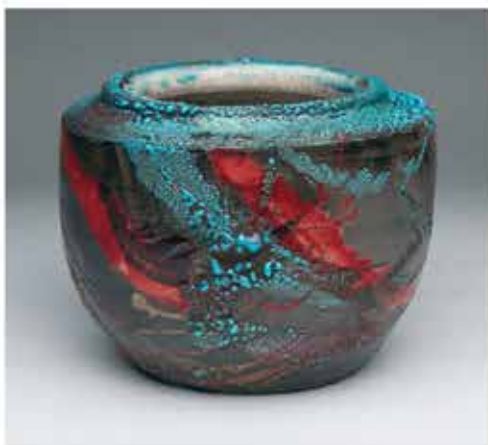
Ed Keith Fusion 4.5" x 4" Thrown raku, raku glaze, post reduction firing $195