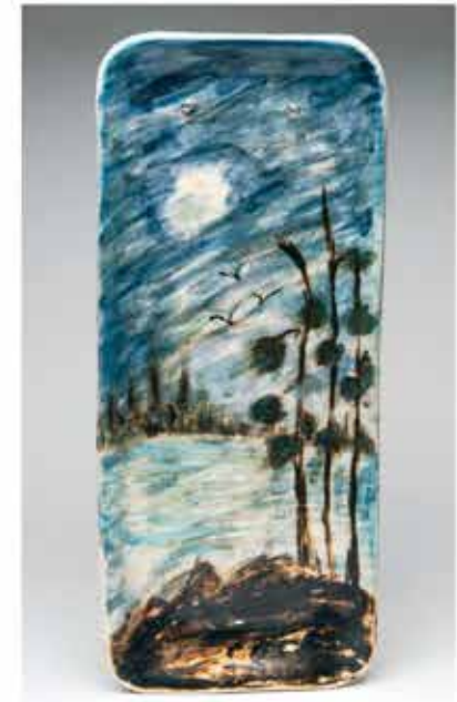
Della Cavanagh Shades of Silence 14"x 6" Handbuilt porcelain, oxidation $75