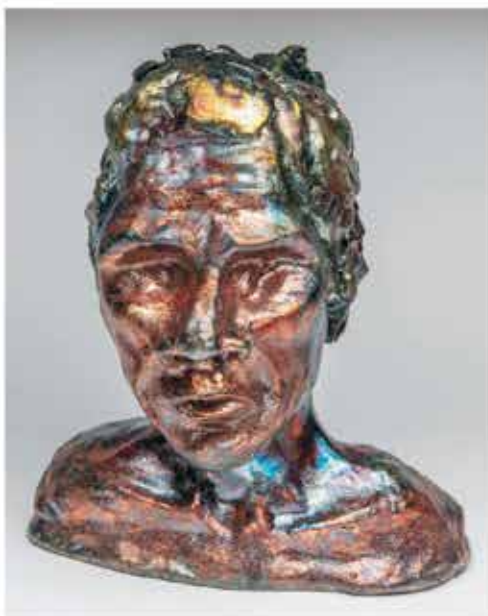
Sharon Mylod From the Original Man 9.5" x 9" x 7" Handbuilt raku, raku glaze, post reduction firing $850