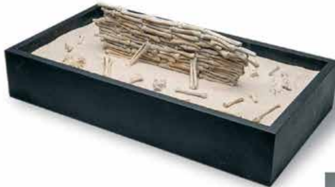
Carol Teale The Wall 6"x 9"x 16.5" Handbuilt stoneware, oxidation $800