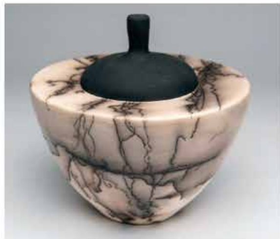
David Schembri Strands 1 6.5" x 6.5" Wheel thrown & assembled stoneware, raku fired, white terra sigillata & horse hair $180